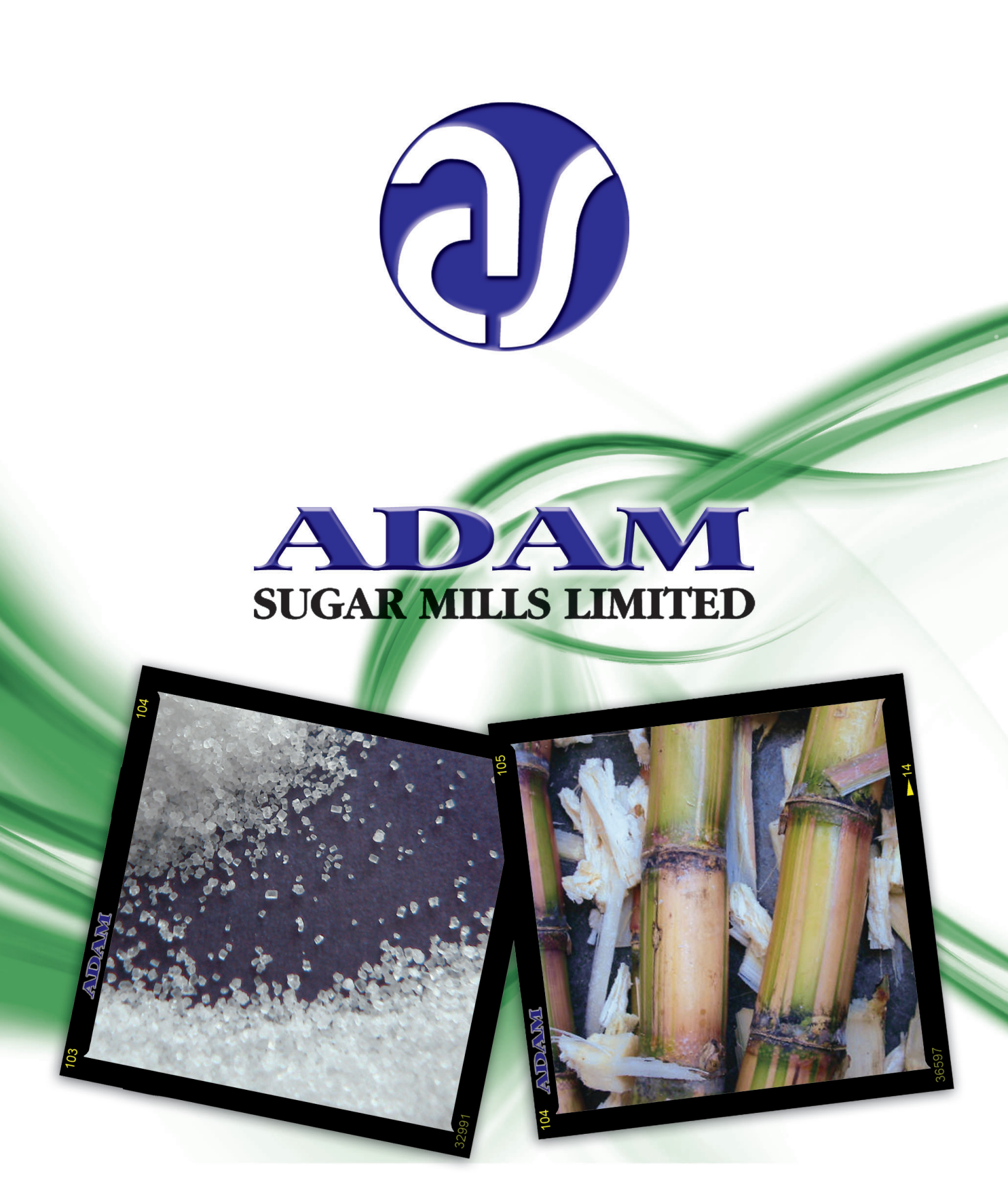
46th Annual Report 2011