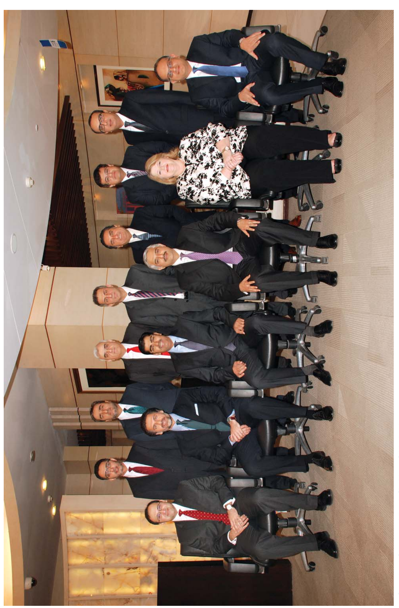
Standard Chartered Bank (Pakistan) Limited Executive Committee Members