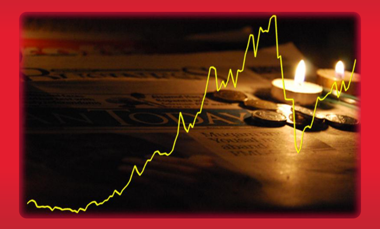
Volume II: Financial Markets