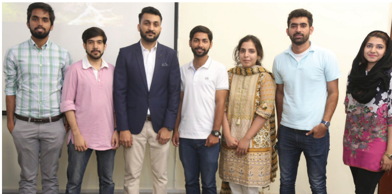
PHOTO-WALK TO KATAS RAJ