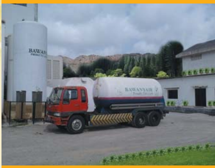
LIQUID STORAGE AND TRANSPORT TANK.

We know that the health and safety of our people is of paramount importance, as is the safety of our processes and the sanctity of the environment. Therefore your Company has established a strategic framework for Environment, Health and Safety by adopting the following measurable objectives: