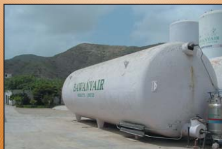
BULK LIQUID STORAGE TANK. (65000M3 CAPACITY)

During the year, the Company's net profit after taxation was Rs. 12 million as compared to a profit after taxation Rs. 51 million in the previous year. The profit after taxation for 2011 has declined primarily due to charge for taxation. In the last year, there was a credit in tax amounting to Rs. 16 million owing to deferred tax asset booked on carried forward tax losses. Since the profitability of the Company has improved, significant tax loss was absorbed in the current year thereby resulting in deferred tax charge for the current year. Another reason for lower profit is the finance cost. In the last year, Company managed to reschedule long term loan of three syndicate members thereby resulting in waiver of mark-up income of Rs. 23 million whereas the current year's rescheduling with two syndicate members resulted in a waiver of only Rs. 5.7 million. These two factors mainly contributed in decrease in overall profit as well as the earnings per share of the Company for the year ended June 30, 2011.