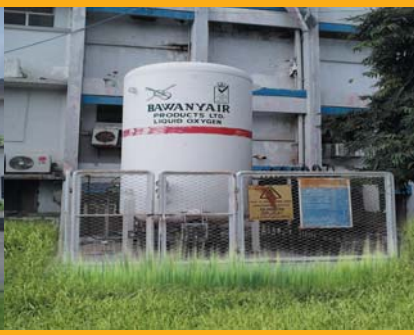
LIQUID TANK INSTALLATION AT NICVD HOSPITAL.