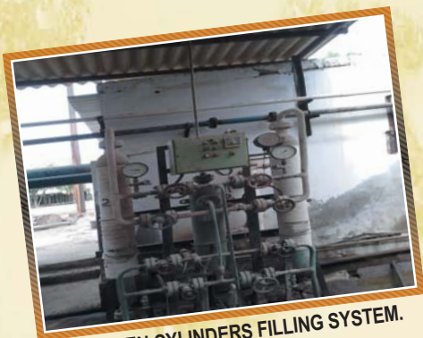
NITROGEN CYLINDERS FILLING SYSTEM.