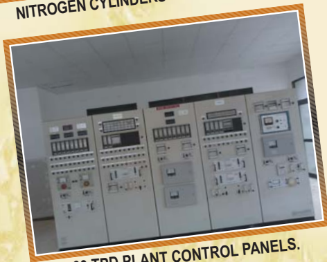
60 TPD PLANT CONTROL PANELS.