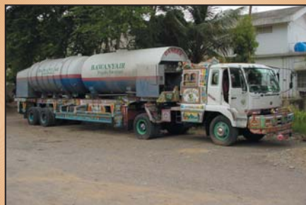
BULK LIQUID TRANSPORT TANKER.