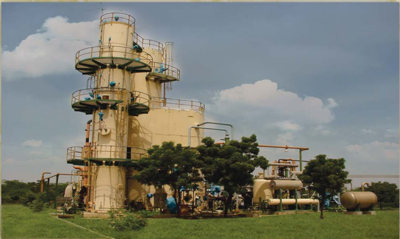
60 TPD PLANT VIEW