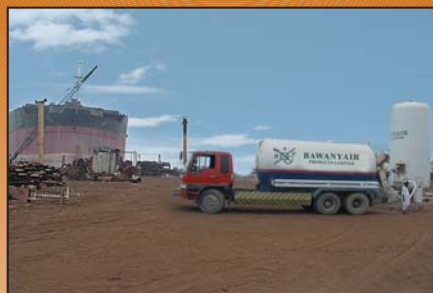
LIQUID TRANSPORT TANK AT GADANI

The Company has achieved gross sales of Rs. 227 million and net sales of Rs. 195 million during the year as compared to the gross and net sales of Rs. 241 million and Rs. 210 million respectively for the last year. The main reason behind slight decrease in turnover was the natural disaster in form of floods that hit the province. The entire road network was halted and that worsened the business conditions. However, this was well tackled by the management of the Company with reducing the cost of goods manufactured by Rs. 15 million thereby increasing the gross profit by Rs. 0.5 million.